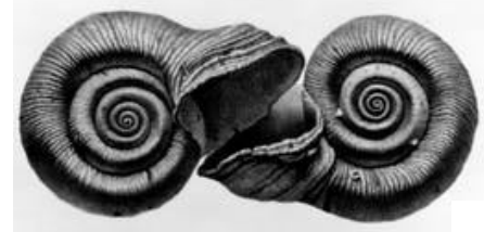
Artist Gendron Jensen captured the tight whorls of Bel Clare snails in this extraordinarily detailed lithograph.